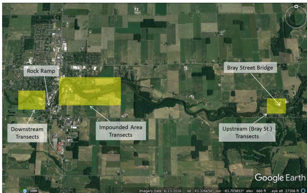
Figure 3. Location of Frankenmuth rock ramp, Bray Street Bridge, and general description of electrofishing locations downstream of the rock ramp, in the impounded area, and upstream sites near the Bray Street Bridge. Yellow rectangles indicate general transect locations.